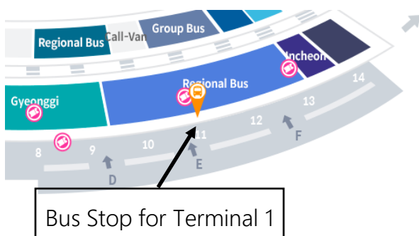
Bus Stop for Terminal 1

Useful Korean: Yi ju so ro ga ju sae yo (Please go to this address)